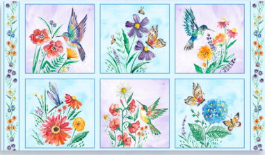
A 3029-11169-467 1 1/3 yds. (2 Panels)