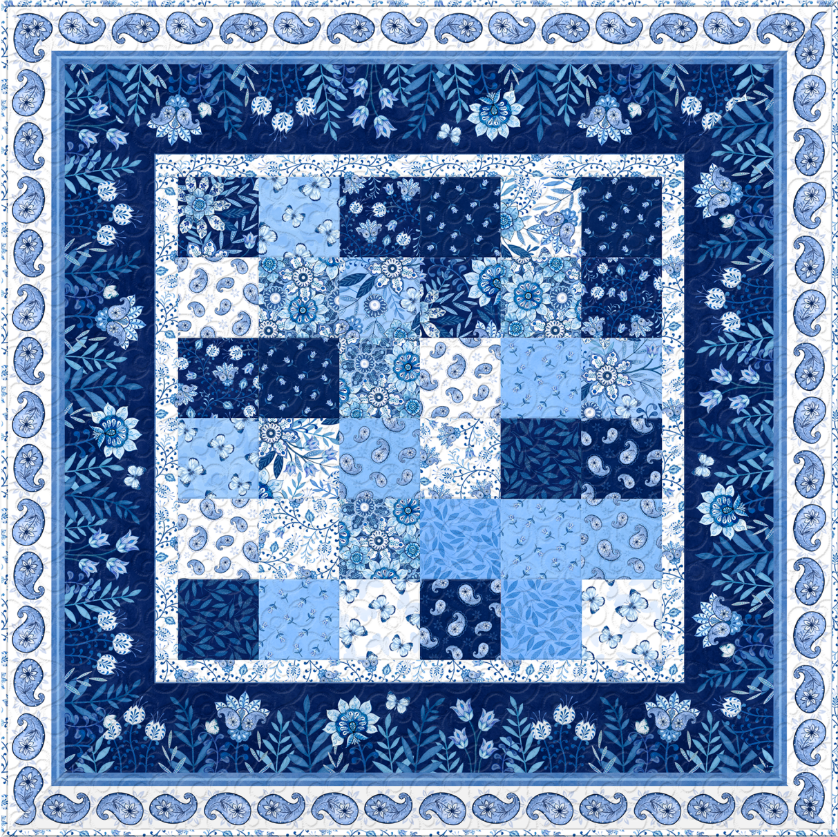
Table Topper: 46" Square