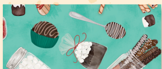
B 3017-27673-713 Top/Bottom Borders 1/2 yd.