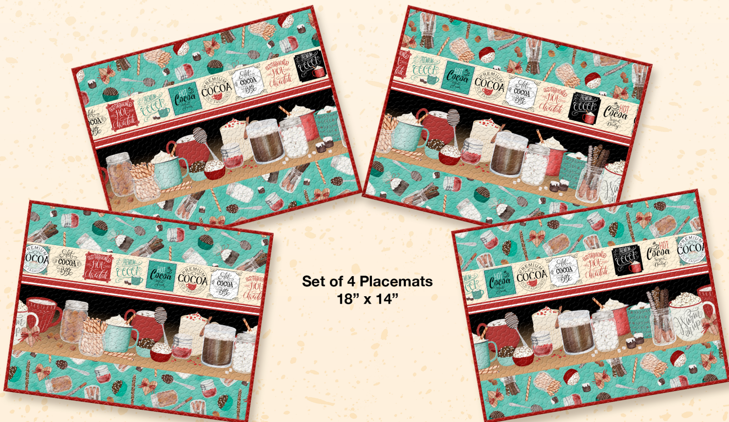
Set of 4 Placemats 18" x 14"